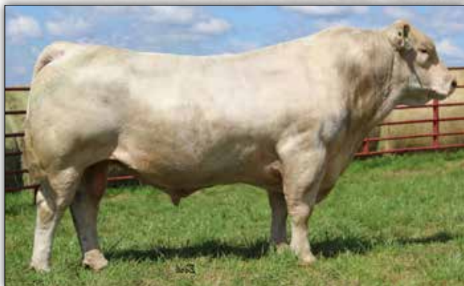
Mead Ledger N413, Maternal brother to Lot 329