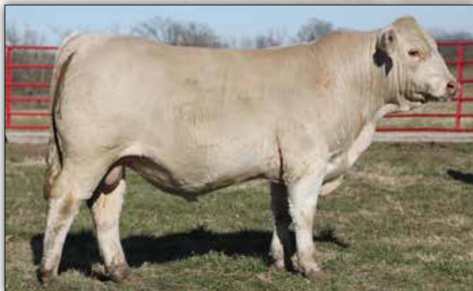
Mead Rushmore U525, Son of Lot 335