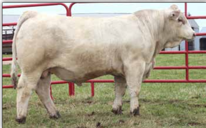
Mead Total Rush V682, Lot 471