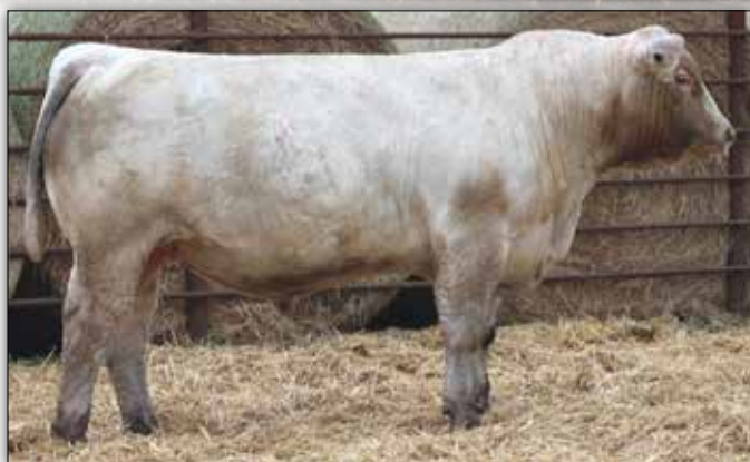
Mead Milestone V032, Son of Lot 341