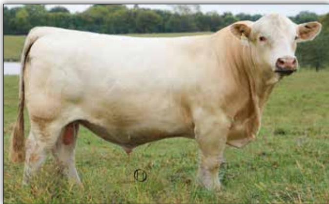
Mead LCC Bullseye T484, Maternal Brother to Lot 334