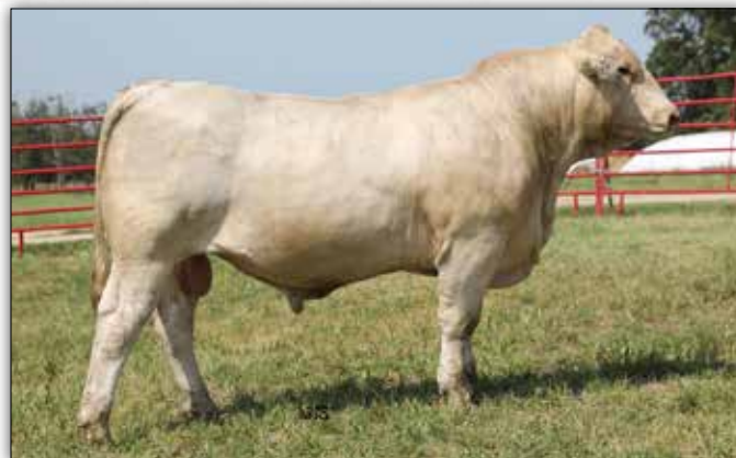
Mead Lockstep, High Selling Charolais Bull to ST Genetics, Paternal Brother to Lots 90-92