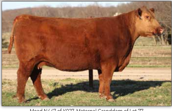
Mead N447 of K027, Maternal Granddam of Lot 77