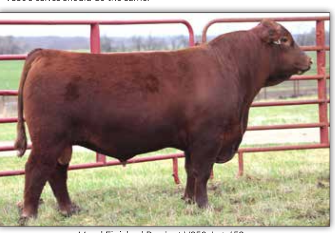
Mead Finished Product V850, Lot 458

Sells as an unregistered bull raised by a 2-year-old dam, now in the ET program.