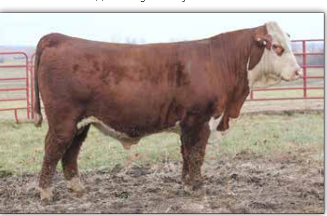
Mead All Star S521, Maternal Brother to Lot 80