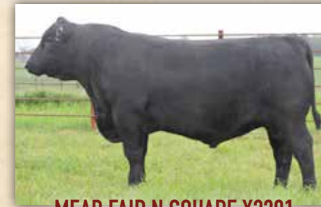
MEAD FAIR N SQUARE X2201

+*Connealy Upscale x ##*Basin Payweight 1682 CED +6, BW +1.2, WW +71, YW +119, Milk +28, CW +56, Marb +.32, RE +.54, $M +92, $W +75, $B +138, $C +271