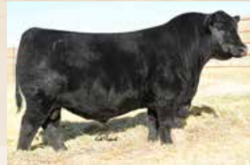
SITZ INCENTIVE 19677938