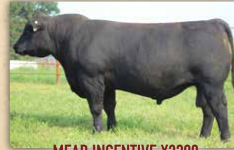
MEAD INCENTIVE X2300

*Musgrave 316 Stunner x ##*Connealy Black Granite CED +6, BW +.6, WW +79, YW +138, Milk +31, CW +69, Marb +.97, RE +.84, $M +62, $W +78, $B +174, $C +288