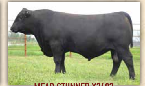
MEAD STUNNER X2403

*Connealy Way Maker x ##*Deer Valley Patriot 3222 CED +11, BW +1, WW +59, YW +103, Milk +35, CW +34, Marb +1.22, RE +.88, $M +83, $W +68, $B +155, $C +284