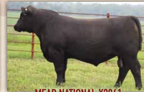
MEAD NATIONAL X2041

*K C F Bennett Exponential x ##*Connealy Power Surge 3115 CED +5, BW +2.3, WW +75, YW +131, Milk +35, CW +70, Marb +1.20, RE +1.06, $M +72, $W +73, $B +201, $C +333