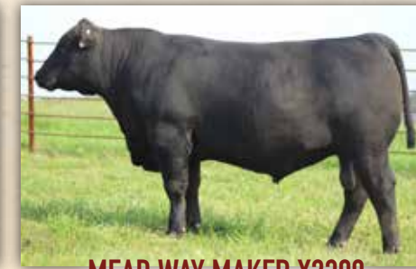
MEAD WAY MAKER X2308

*Myers Fair-N-Square M39 x ##*Connealy Mentor 7374 CED +5, BW +2.0, WW +68, YW +121, Milk +29, CW +55, Marb +.63, RE +.72, $M +87, $W +69, $B +145, $C +275