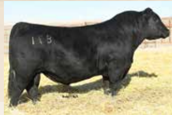
DVAR HUCKLEBERRY 19211568