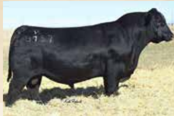
TEHAMA TAHOE 17817177