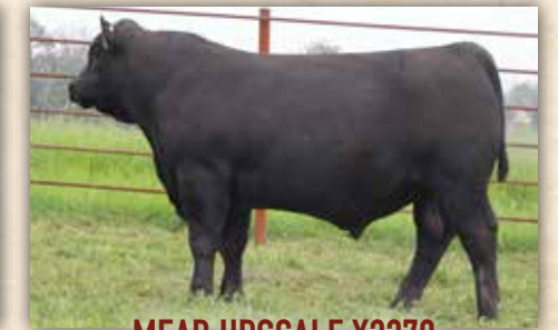
MEAD UPSCALE X2278

*Connealy National 390C x ##*KM Broken Bow 002 CED +9, BW +8, WW +66, YW +113, Milk +38, CW +40, Marb +.45, RE +1.19, $M +90, $W +78, $B +128, $C +256