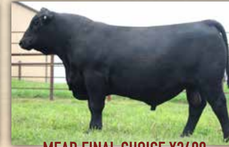
MEAD FINAL CHOICE X2408

*SITZ Incentive 704H x ##*A A R Ten X 7008 S A CED +6, BW -.2, WW +80, YW +133, Milk +24, CW +54, Marb +.19, RE +.91, $M +85, $W +80, $B +117, $C +237