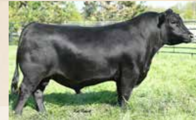
MYERS FAIR-N-SQUARE 19418329