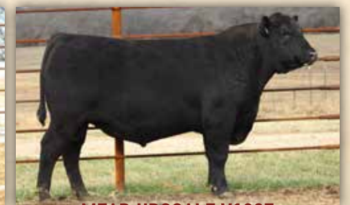
MEAD UPSCALE V1897

Birth Date: 11-04-2021 • Reg. 20364850 +*Deer Valley Growth Fund x #*Koupal Advance 28 CED +10, BW +1.5, WW +98, YW +173, Milk +32, CW +85, Marb +.42, RE +.91, $M +51, $W +90, $B +176, $C +279