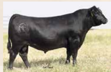
MEAD MAGNITUDE 18543414