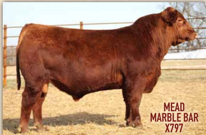
MEAD MARBLE BAR X797

Birth Date: 11-21-2021 • Reg. *20381473 +*Connealy Upscale x #*Basin Advance 3134