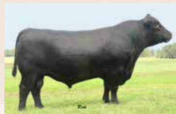
MEAD FINAL CHOICE L239 17315700