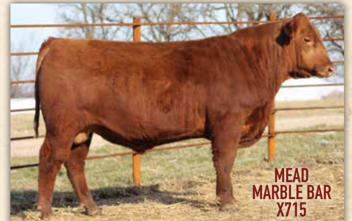
MEAD MARBLE BAR X715

Birth Date: 11-10-2021 • 4600431 MILWILLAH MARBLE BAR J53 x BECKTON EPIC R397 K