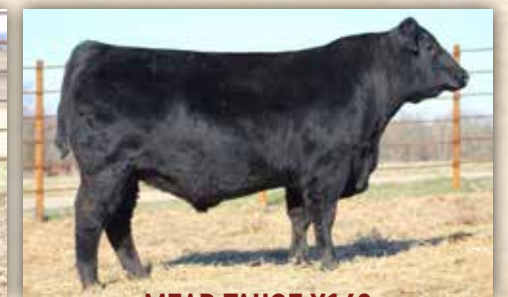
MEAD TAHOE X168

Birth Date: 12-19-2021 • Reg. *20364242 Mead Perseverance R1266 x +*LD Capitalist 316 CED +8, BW +1.0, WW +84, YW +151, Milk +30, CW +71, Marb +.89, RE +.67, $M +62, $W +81, $B +184, $C +301