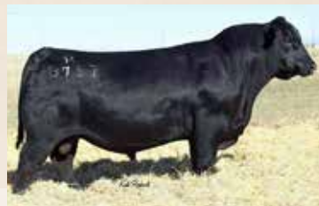
TEHAMA TAHOE B767 17817177