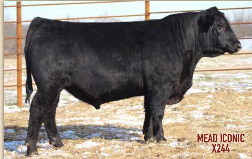
MEAD ICONIC X244