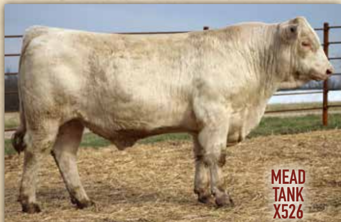
MEAD TANK X526

A TOP SET OF BALDIE MAKING HEREFORD BULLS WILL BE SELLING.