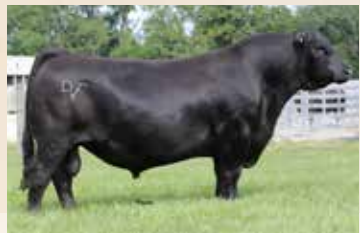
DEER VALLEY GROWTH FUND 18397542