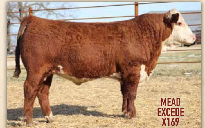
MEAD EXCEDE X169

Birth Date: 11-21-2021 • P44354001 BEHM 100W CUDA 504C x /S MANDATE 66589 ET