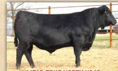
MEAD TRUE NORTH X868

Birth Date: 11-16-2021 • Reg. *20364225 *Connealy Convoy x #+*PVF Insight Q129 CED +12, BW -.2, WW +73, YW +131, Milk +28, CW +63, Marb +.50, RE +1.26, $M +84, $W +75, $B +160, $C +292