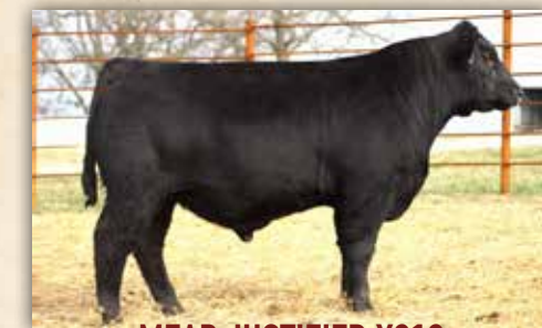
MEAD JUSTIFIED X313

Birth Date: 12-18-2021 • Reg. *20364161 #*KG Justified 3023 x +*Connealy Beyond Doubt 838X CED +6, BW +1.4, WW +78, YW +134, Milk +30, CW +57, Marb +1.11, RE +.63, $M +91, $W +80, $B +163, $C +302