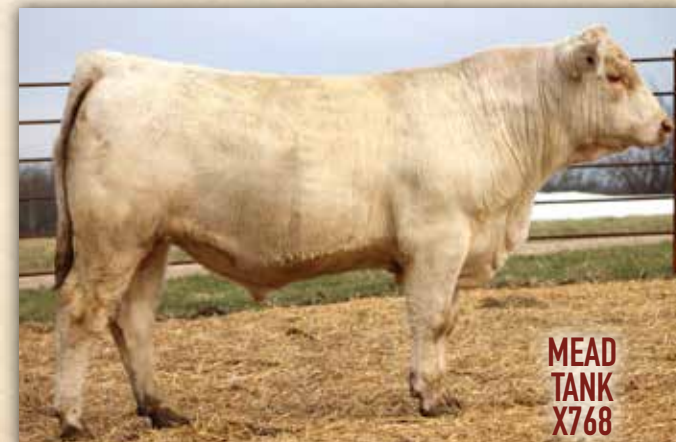
MEAD TANK X768

Birth Date: 12-25-2021 • M969559 DC/CRJ TANK E108 P x SMR WALDORF 83W PLD