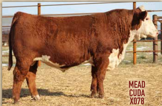
MEAD CUDA X078

Birth Date: 11-15-2021 • M969554 DC/CRJ TANK E108 P x LT LEDGER 0332 P