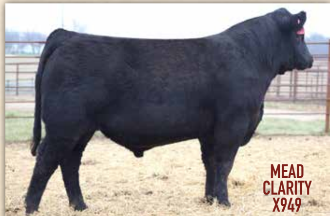
MEAD CLARITY X949

OUTSTANDING SURE-FIRE CALVING EASE RED ANGUS BULLS WILL BE SOLD THAT ALSO EXCEL FOR HIGH PERFORMANCE.