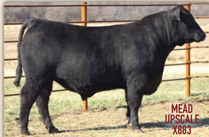
MEAD UPSCALE X883

Birth Date: 12-10-2021 • Reg. +*20396292 *Connealy Clarity x #*Connealy Final Solution