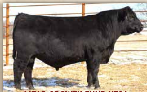
MEAD GROWTH FUND X734

Birth Date: 11-15-2021 • Reg. *20366488 +*Square B True North 8052 x KG Solution 3029 CED +12, BW -.9, WW +82, YW +152, Milk +38, CW +63, Marb +.86, RE +.69, $M +64, $W +88, $B +166, $C +279