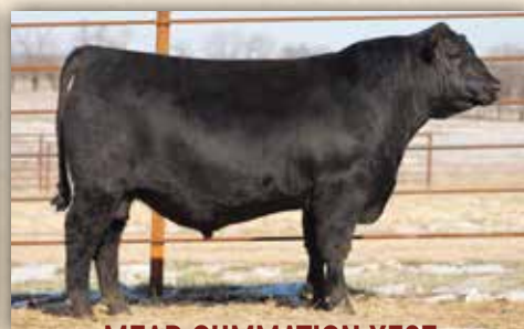
MEAD SUMMATION X587

Birth Date: 12-18-2021 • Reg. *20365058 #+*Tehama Tahoe B767 x +*LD Capitalist 316 CED +10, BW +.1, WW +75, YW +136, Milk +33, CW +68, Marb +.95, RE +.80, $M +66, $W +80, $B +175, $C +293