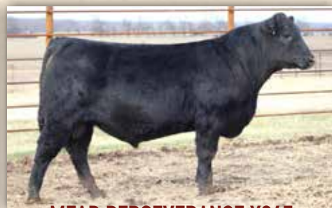
MEAD PERSEVERANCE X945

Birth Date: 12-18-2021 • Reg. *20364161 #*KG Justified 3023 x +*Connealy Beyond Doubt 838X CED +6, BW +1.4, WW +78, YW +134, Milk +30, CW +57, Marb +1.11, RE +.63, $M +91, $W +80, $B +163, $C +302