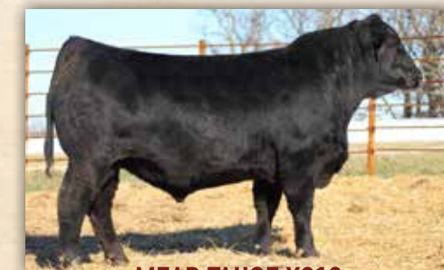
MEAD TAHOE X312

Birth Date: 11-30-2021 • Reg. *20364829 #+*Tehama Tahoe B767 x Mead Perseverance R1266 CED +12, BW +.7, WW +85, YW +150, Milk +24, CW +51, Marb +1.09, RE +.75, $M +88, $W +79, $B +163, $C +299