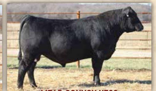
MEAD CONVOY X792

Birth Date: 12-15-2021 • Reg. *20373399 +*K C F Bennett Summation x #*Plattmere Weigh Up K360 CED +13, BW -.6, WW +80, YW +149, Milk +32, CW +74, Marb +.67, RE +.71, $M +50, $W +77, $B +170, $C +270