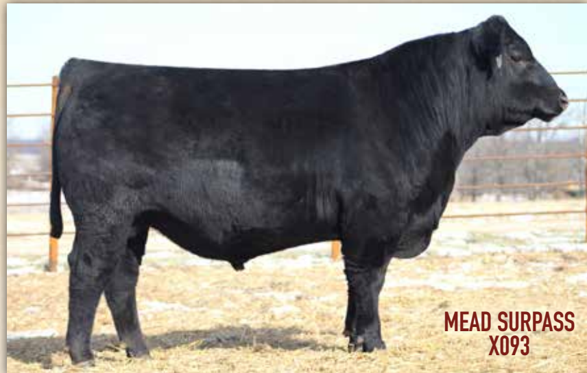
MEAD SURPASS X093